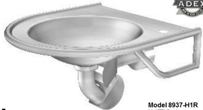
Model 8937-H1R Metaal Basin with Faucet Mounting on Right Side